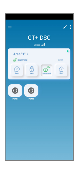
The system will appear in Protegus on the user's phone

After completing the setup and installation perform a system check: