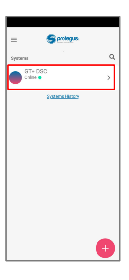
Press on system