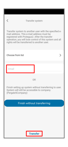
Enter the e-mail of the user to whom the installer will transfer the system. Press "Transfer"