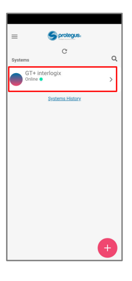
Press on system