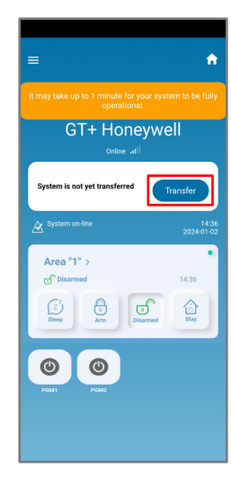
Wait 1 minute and press "Transfer"