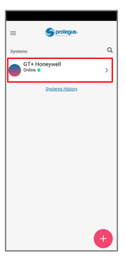
Press on system