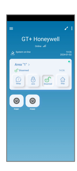
The system will appear in Protegus on the user's phone

Enter the e-mail of the user to whom the installer will transfer the system. Press "Transfer"